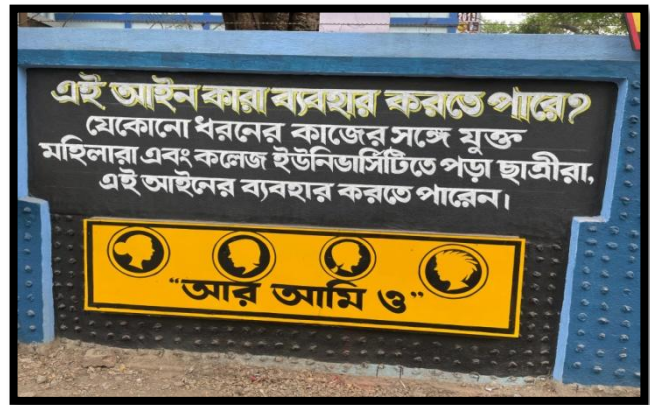
Mural on the outer wall of the college