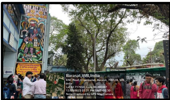
Mural painting on inner wall of college