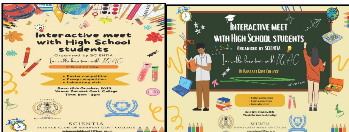
POSTERS OF THE EVENT