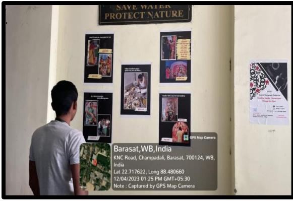
Photography exhibition on 'Breaking Gender stereotypes'