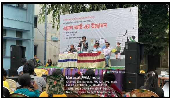
Talks by visiting dignitaries