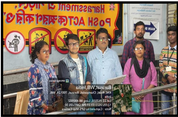
Inauguration of wall art