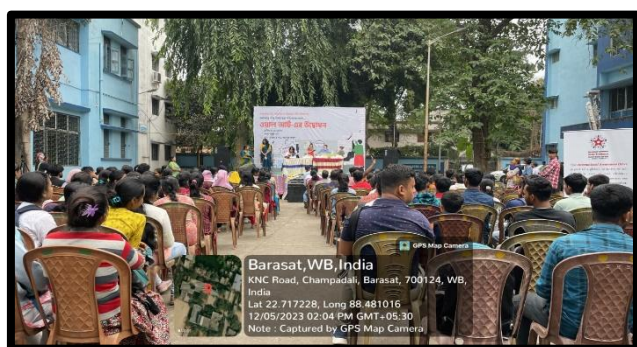
Spectators to the inauguration event