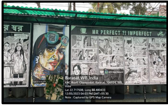
Mural painting on stories on gender harassment in work place